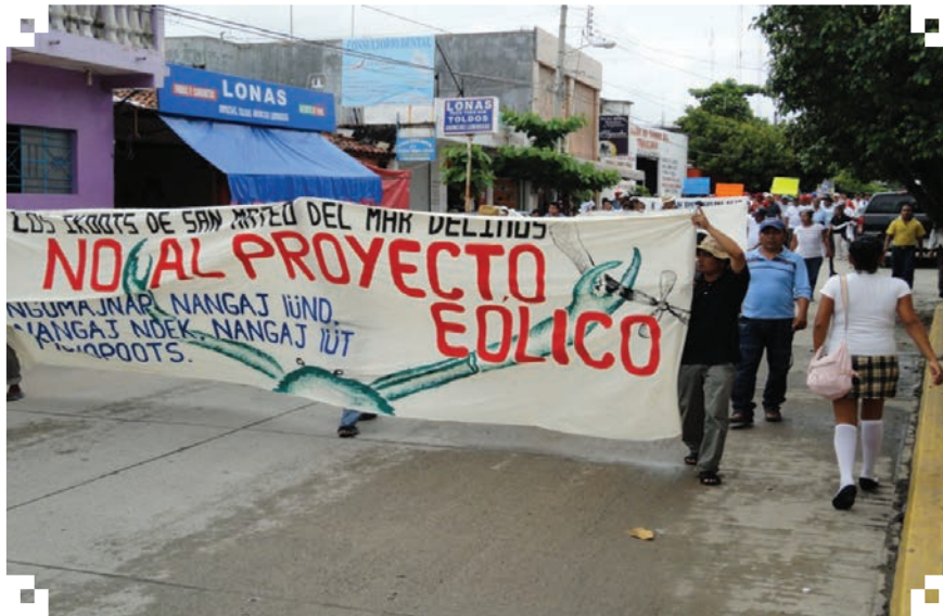
The populations of the Isthmus of Tehuantepec rejects the wind energy projects

Evidence shows that it is the private corporate sector, rather than the SMEs, which is the main beneficiary of LAIF projects through the procurement processes for mega-scale investments in infrastructure. Since the priorities of the LAIF projects focus on introducing technological innovation from Europe under the “green economy” framework, especially in the energy and green technology sectors, it would not be surprising that most of the contracts are to be awarded to European companies 32 . This is the case in all the ten projects approved so far, but the clearest example is the construction of the wind farm in Tehuantepec Isthmus in Mexico through a project entitled Bii Nee Stipa II. This project is lead by SIMEST, an Italian Development Finance Institution whose mission is to support Italian companies’ activities abroad. Consequently, the project is carried out by the Italian energy giant ENEL 33 . Spain, a member state of the EU, surely voted in favour of approval of this project as ENEL collaborates closely with Spanish wind power company Gamesa 34 . The wind farms in Tehuantepec have been criticized by local people because they occupy ancestral lands of indigenous people and provide energy primarily for the partner companies of the European investors (Nestlé Group and Coca-Cola), and not for the population in the area 35 .