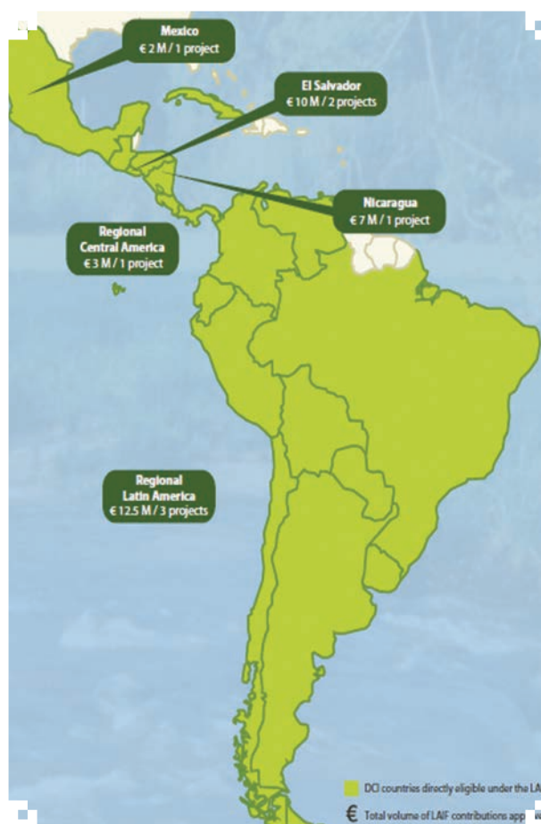
Map on the investments of the LAIF in AL presented in the report for the period 2010-2011

The EU justifies the focus on energy and infrastructure arguing that the Latin American countries face significant difficulties in finding investment capital for improving infrastructure (which are fundamental for technological development and improving competitiveness in the global markets). This in turn might lead to faster growth and poverty reduction. For their part, Latin American governments also highlight the private sector orientation, access to European investors, and the importance of these investors in support of EU foreign direct investments in the region.