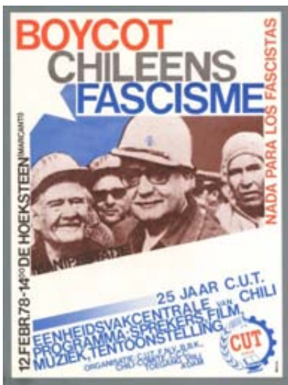
4. Manifestation of Trade Unions, Amsterdam, 1978

The posters cover many special topics. Some petition money for community kitchens, social projects for women and children or the clandestine media. Others protest against human rights violations or demand the truth about the disappeared and the liberation of political prisoners. They urge support of the resistance movement, sometimes with bayonet rifles as a symbol of armed struggle. Many posters called for a boycott of Chilean products (figures 2, 4) and the isolation of the military junta (figure 3).