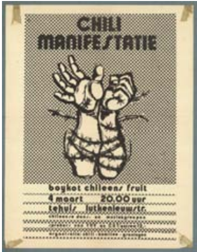
2. Chili Komitee Groningen, 1977