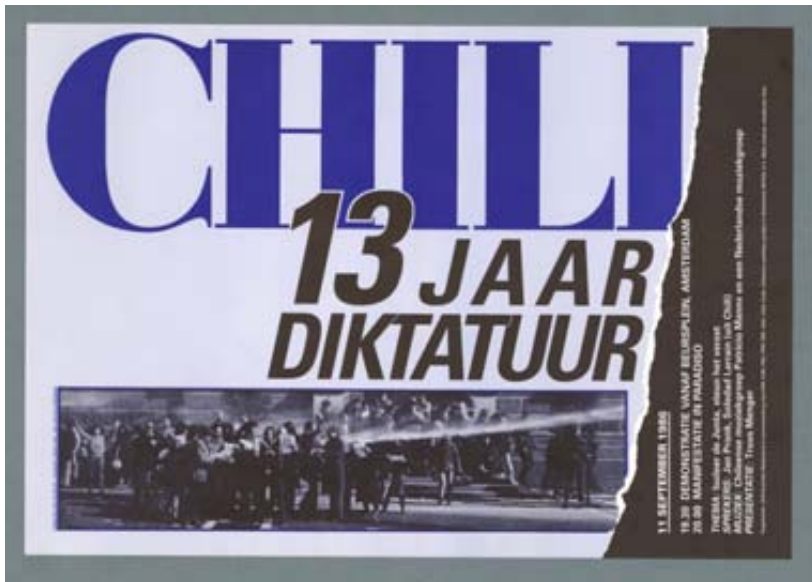
5. National manifestation, 11 September 1986, Amsterdam (Rob van der Doe)

The Chilean coup and its exiles not only strengthened the Dutch solidarity movement and the public interest in Latin America, but also strongly influenced Latin American studies in the Netherlands. Dutch and exiled Chilean scholars started studying the characteristics of new military dictatorships, human rights violations, social movements, civil society, (transitions to) democracy and citizenship, not only in Chile but also in other parts of Latin America. That these themes became so important was surely related to the Chilean experiences. Dissertations on Chile were published by Chileans living in the Netherlands, for example Alex Fernández Jilberto on the political opposition against the dictatorship and Patricio Silva on the agrarian policy of the dictatorship. 3