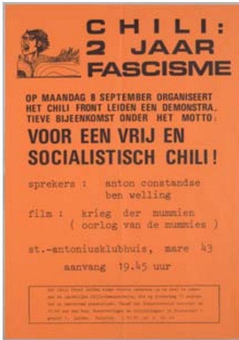
1. Chili Front Leiden, 1975

(Amsterdam) and local manifestations on 11 September, the date of the coup (figures 1, 3, 5). Some posters are very simple, hastily made to announce local actions or manifestations (figures 1, 2). Others are made by professional artists and cartoonists. After refugees arrived, many posters were influenced by Chilean artistic styles, such as the tradition of political mural paintings (figure 3).