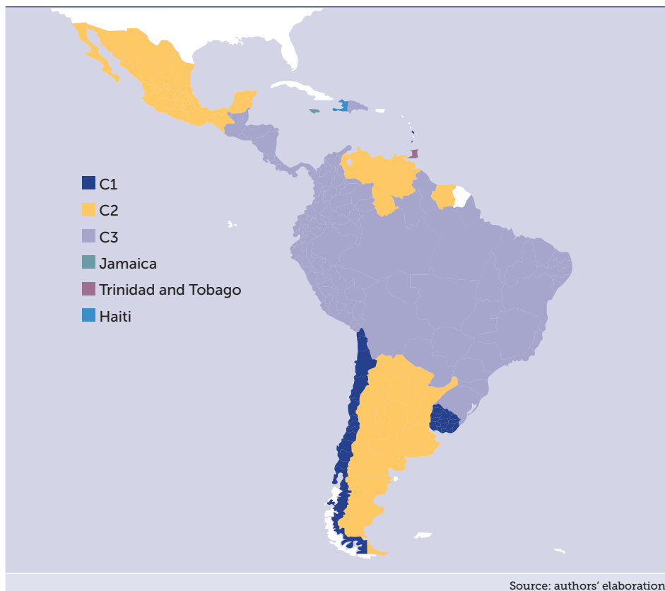
Map 1. SDG Taxonomies of LAC countries

inclusion, environmental sustainability and good governance) and differs notably from the classification according to income level per capita . Thus, although the two initial clusters, on average terms, group together the countries with the highest incomes, the third cluster includes two of the richest countries (Brazil and Panama) together with a considerable number of countries with incomes much lower than those with which they share similar development challenges. In short, these results reveal that beyond overtly simple and “economistic” classifications such as those based on income per capita there is no “monotonically increasing” distribution of development levels, ranging from a group of countries with the worst records in all indicators to another group with better results in all variables. Conversely, the present multi-dimensional taxonomy offers more complex and differentiated groupings, allowing thereby the identification of both challenges and opportunities for progress in any of the clusters.