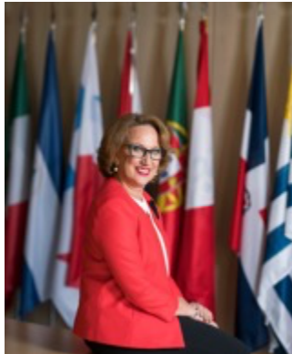
Rebeca Grynspan Secretary General, Ibero- American General Secretariat (SEGIB)

Rebeca Grynspan is the Ibero-American Secretary-General since 2014. In 2010 she was named Under-Secretary-General of the United Nations (UN) and Associate Administrator of the United Nations Development Program (UNDP). From 2006 to 2010, she was UNDP Regional Director for Latin America and the Caribbean. She has been a member of the High-Level Panel on Financing for Development.